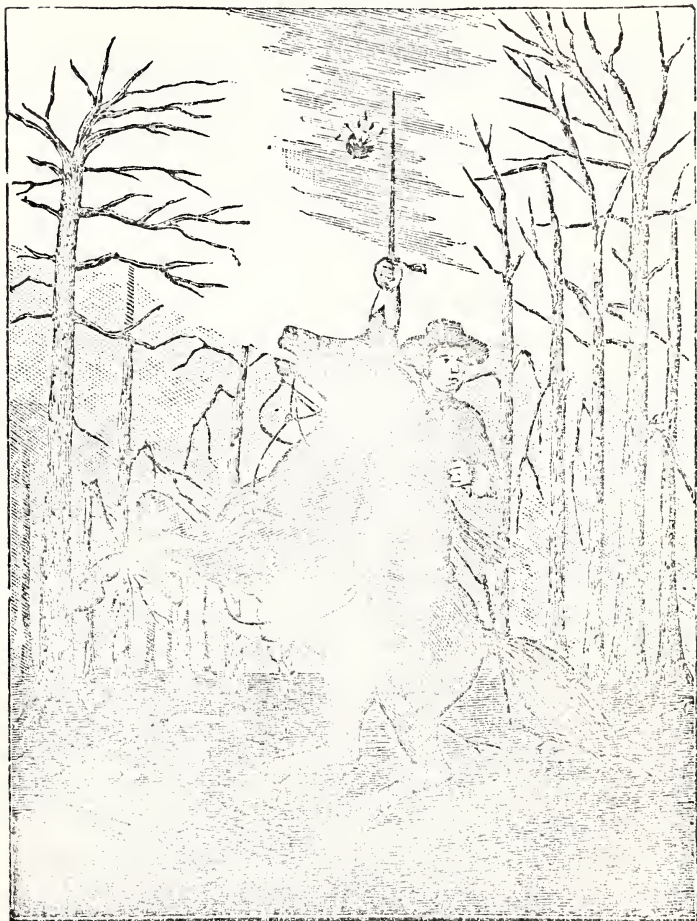
HORSE REARS AT A SHOT THROUGH THE WITHERS.